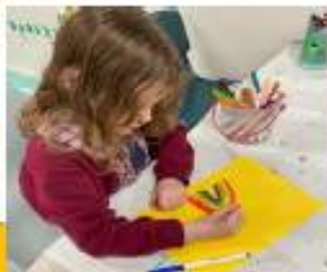
A Glimpse of Week 8 &9