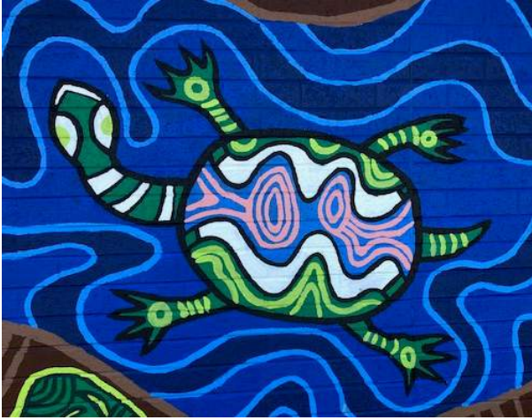
Bundabun , meaning long-necked turtle

I'm really excited to unveil our new House structure at Reservoir Views Primary School. After community consultation and approval from the Wurundjeri Woi Wurrung Cultural Heritage Aboriginal Corporation to have ongoing use of the Woi wurrung language, we now have our four new house teams.