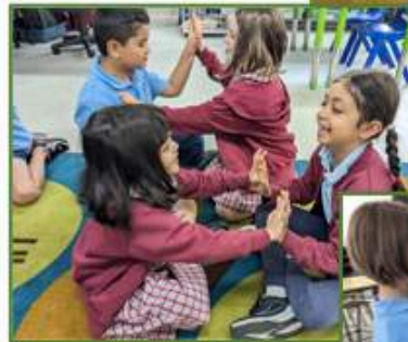
Connecting with each other through musical greetings and games in 1/2