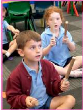
Keeping time with hula hoops and rhythm sticks in Foundation and F/1