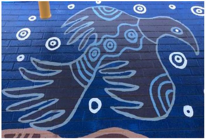
Bunjil , meaning wedge-tailed eagle