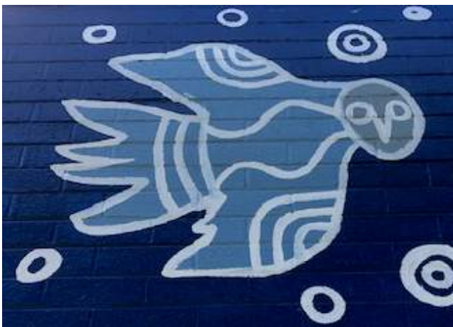
Muk Muk , meaning owl