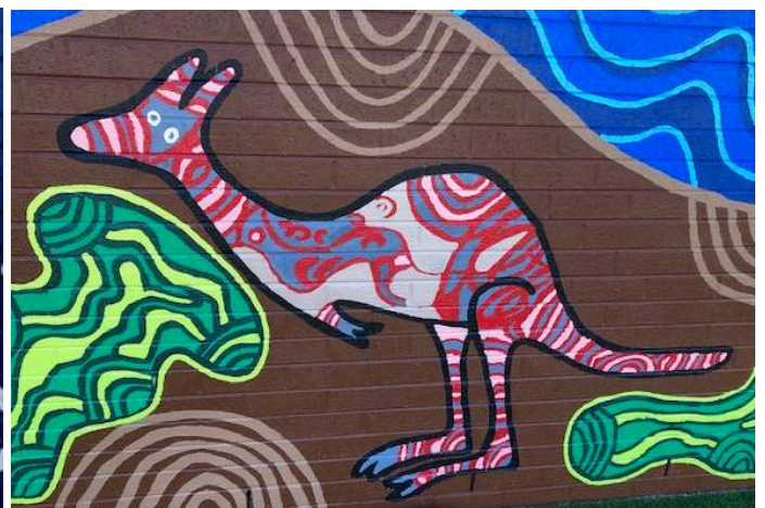
Marram , meaning kangaroo

Bundabun will be associated with the colour green.