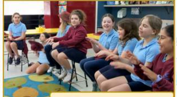
Some stellar singing in 3-6 Choir!