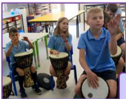
Enhancing our rhythm learning with percussion instruments in 2/3/4 and 4/5/6