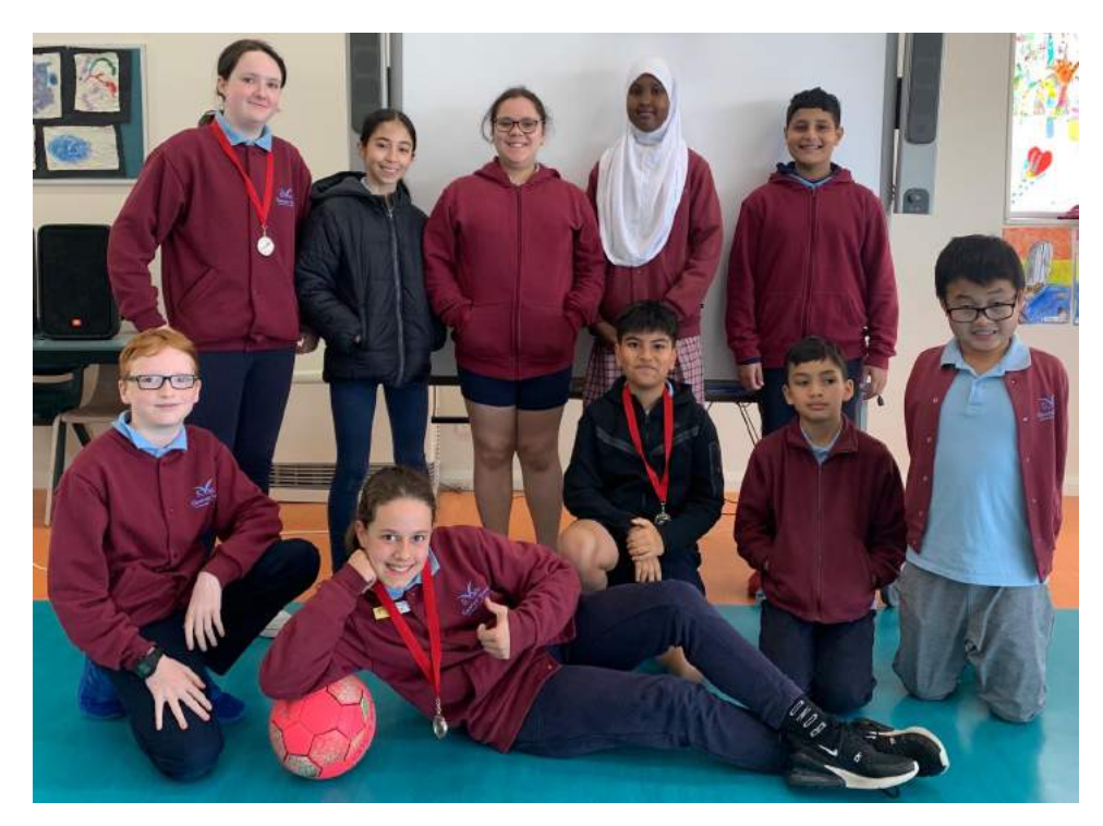
Our girls and boys soccer teams played extremely well last week.

Well done to our girls team, they came second.