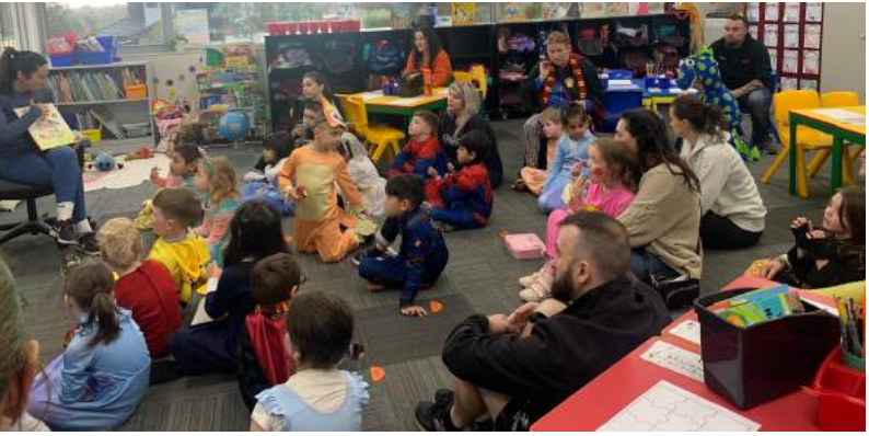
We had lots of families in our classrooms ready to celebrate book week with us.