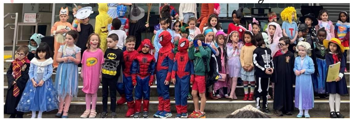
We can sign a rainbour

Great work to all the foundation students for signing our rainbow song during the book week parade.