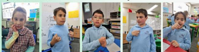
woman sick grandfather I sister