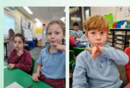
girl boy children