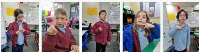
sick he feel boy feel