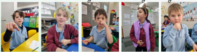
you our people feel man