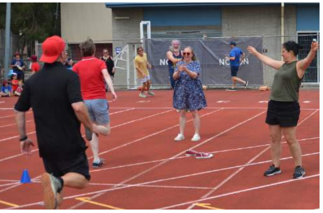
The parent/caregiver/guardian race was AMAZING!!!!!!!!