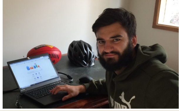
At Reservoir Views Primary School we value : Love of Learning ~ Resilience ~ Respect