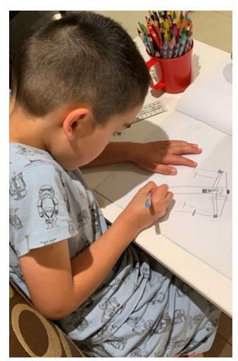
At Reservoir Views Primary School we value: Love of Learning ~ Resilience ~ Respect